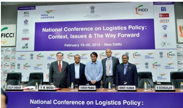
National Conference on Logistics Policy (Delhi) Feb 19 - 20, 2019