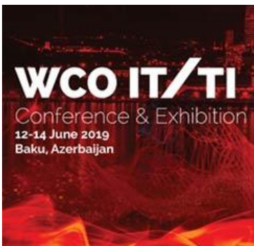
WCO's IT/TI Conference & Exhibition Baku, Azerbaijan, June 12 - 14, 2019