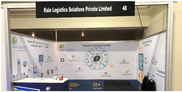
Air Cargo Africa (ACA), (S. Africa) Feb 19 - 21, 2019