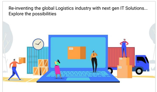
Watch our latest corporate showreel