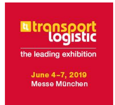
Messe München's transport logistic 2019 Munich, Germany, June 4 - 7, 2019