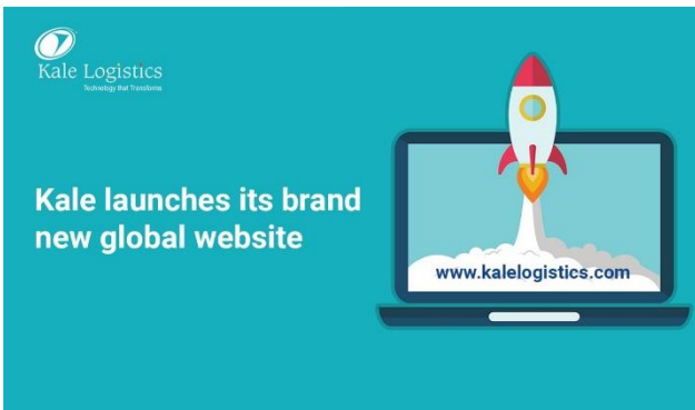
Kale launches its global website