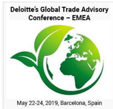
Forthcoming events Deloitte's Global Trade Advisory Conference - EMEA 2019 Barcelona, Spain, May 22 - 24, 2019