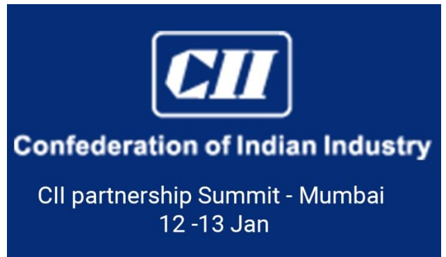
CII partnership Summit - Mumbai Jan 12 - 13, 2019