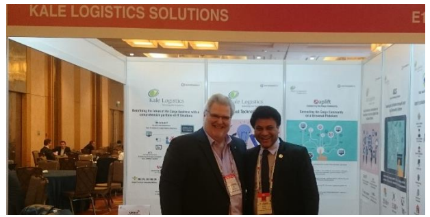
World Cargo Symposium (WCS) Singapore March 12 - 14, 2019